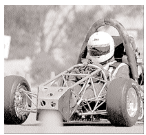
Off and racing: The Royal Melbourne Institute of Technology car in action.

YESTERDAY the Tailem Bend Mitsubishi test track got a taste for what is ahead as university students warmed-up for the Formula Society of Automotive Engineers Australasia competition.